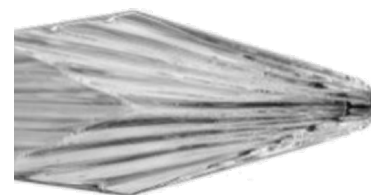
Clear Amber Smoke Bronze