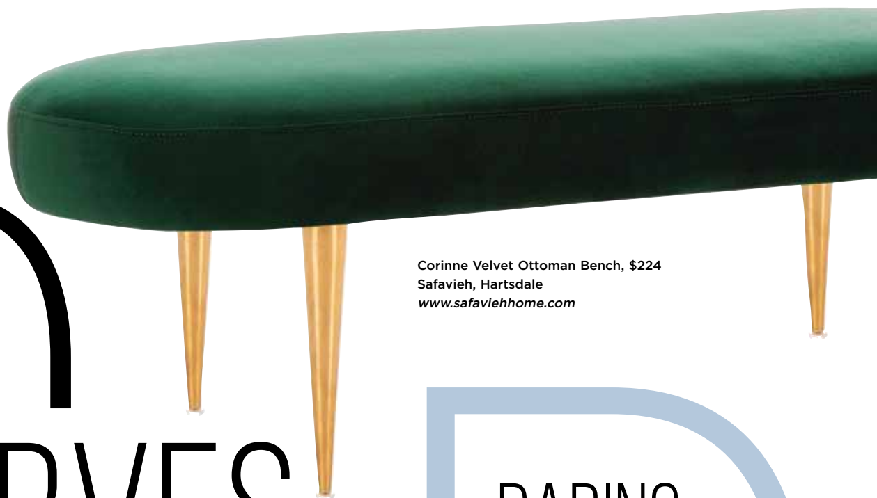
Corinne Velvet Ottoman Bench, $224 Safavieh, Hartsdale www.safaviehome.com