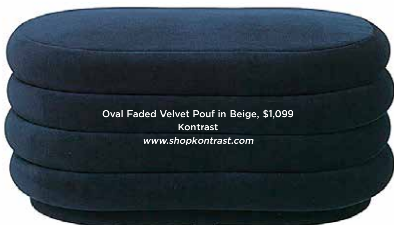
Oval Faded Velvet Pouf in Beige, $1,099 Kontrast www.shopkontrast.com