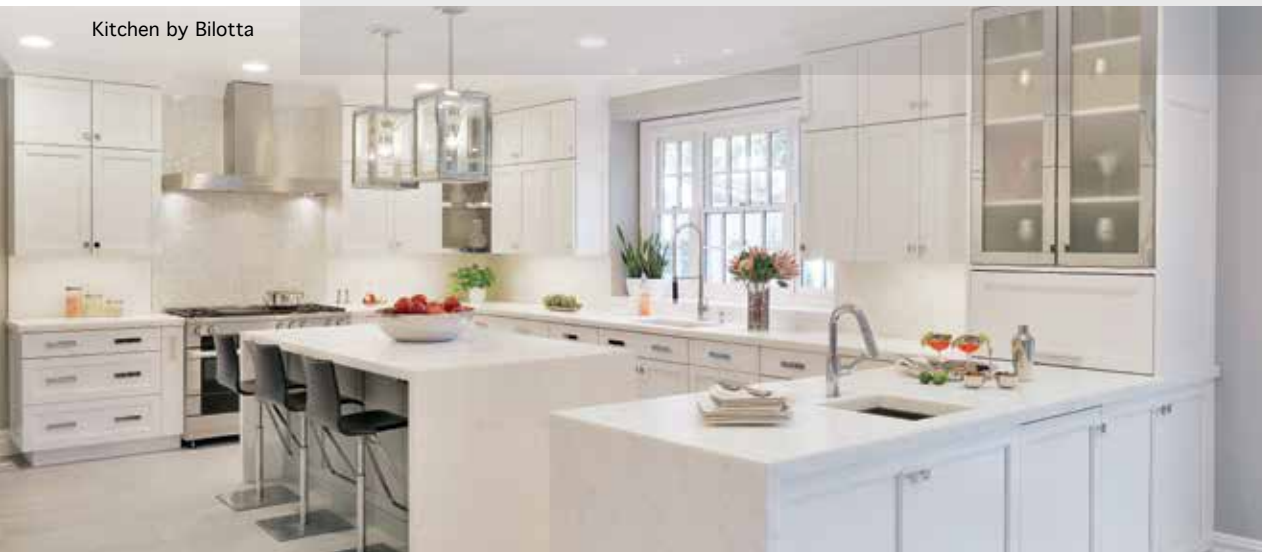
Kitchen by Bilotta