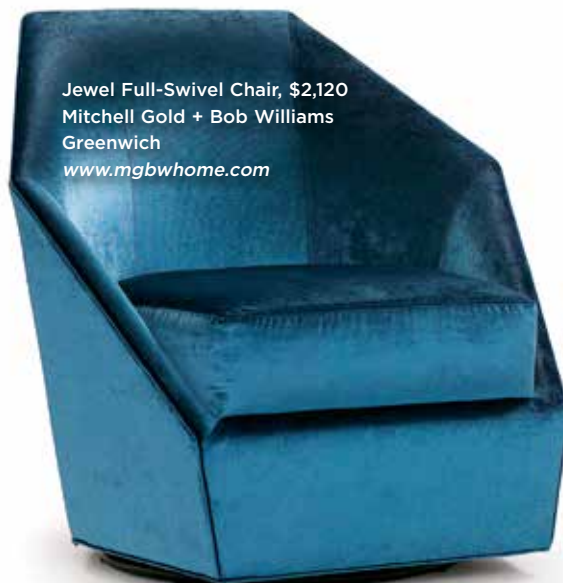
Jewel Full-Swivel Chair, $2,120 Mitchell Gold + Bob Williams Greenwich www.mgbwhome.com