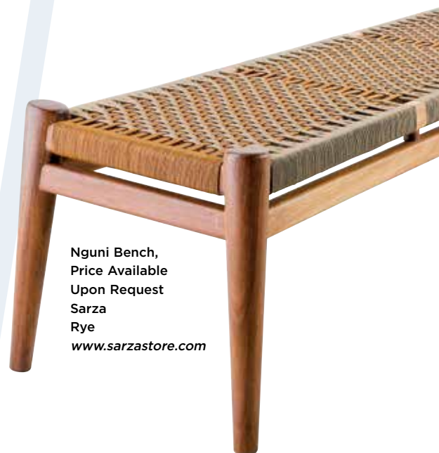
Nguni Bench, Price Available Upon Request Sarza Rye www.sarzastore.com