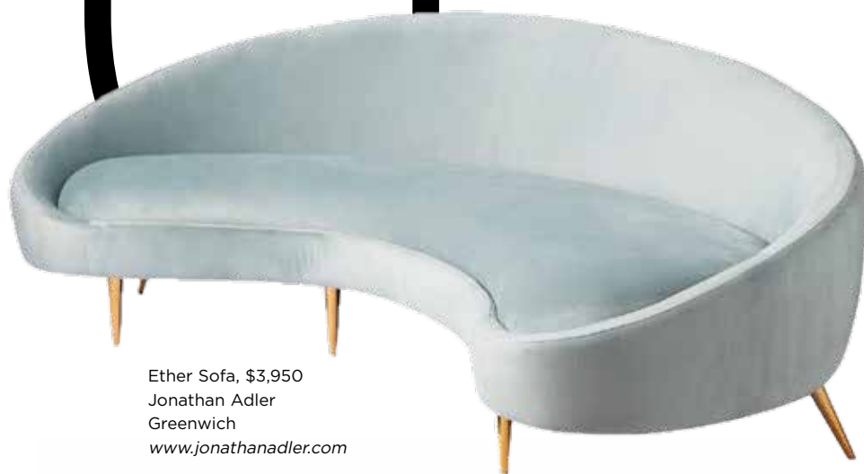
Ether Sofa, $3,950 Jonathan Adler Greenwich www.jonathanadler.com