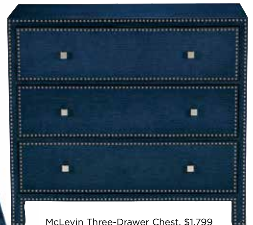
McLevin Three-Drawer Chest, $1,799 Ethan Allen, Hartsdale www.ethanallen.com