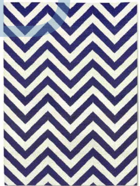
Reversible Peruvian Flat-Weave Rug, $960-$3,200 Jonathan Adler, Greenwich www.jonathanadler.com