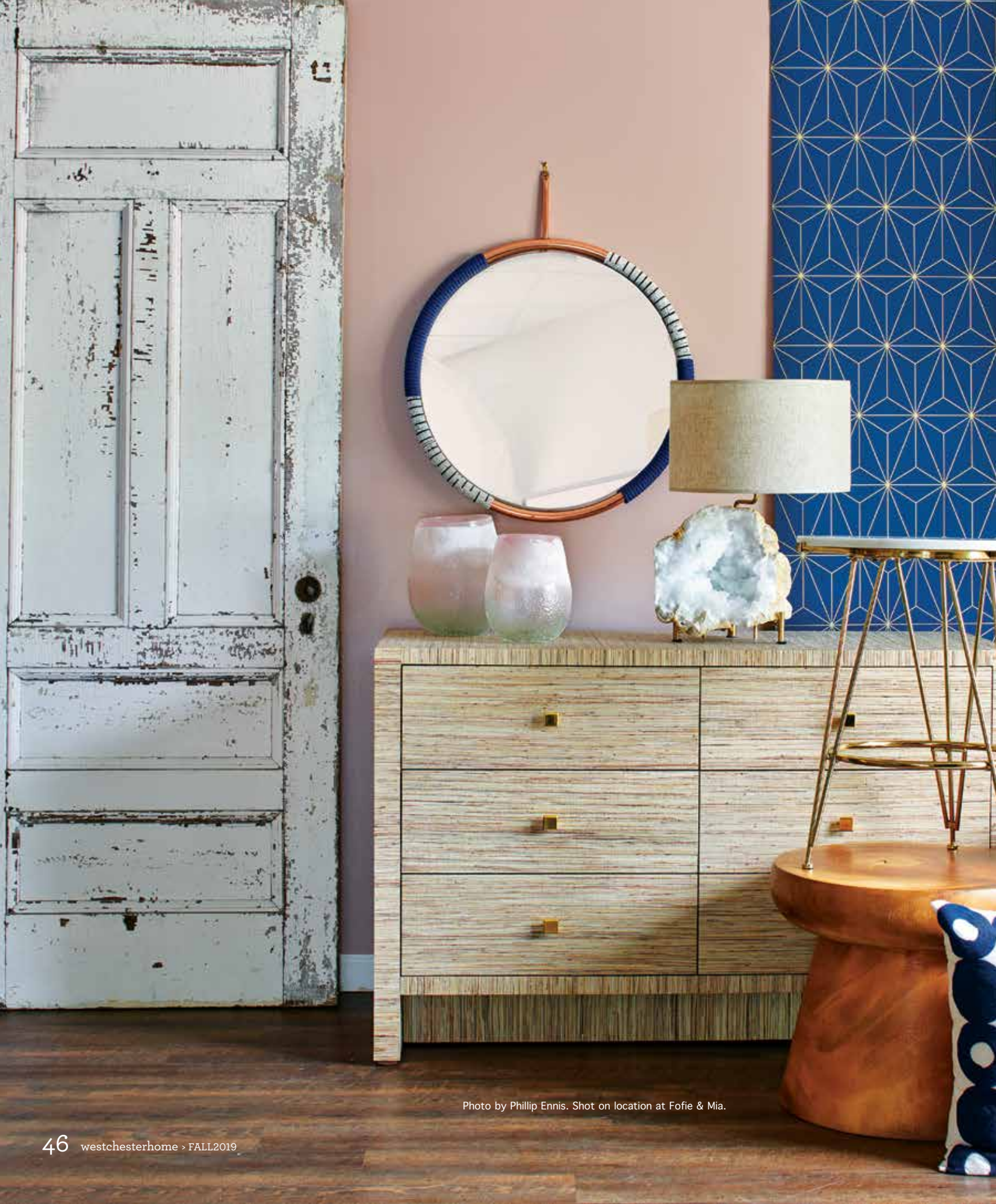
Shot on location at Fofie & Mia.