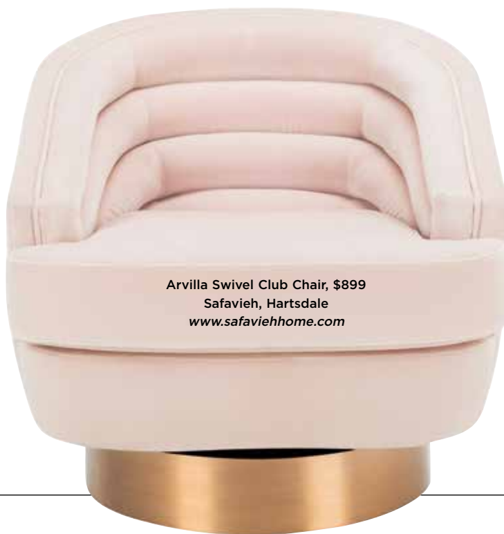
Arvilla Swivel Club Chair, $899 Safavieh, Hartsdale www.safaviehome.com