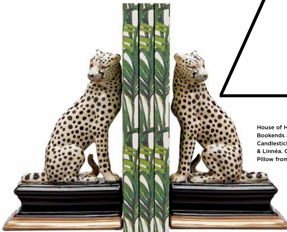
House of Hackney Cheetah Bookends and Cocodrilo Candlestick Holder from Rosehip & Linnéa. Cape Leopard Throw Pillow from Sarza.