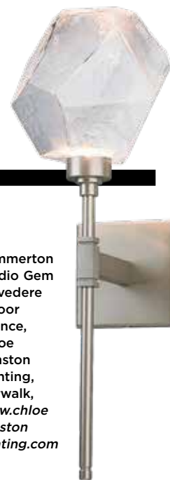
Hammerton Studio Gem Belvedere Indoor Sconce, Chloe Winston Lighting, Norwalk, www.chloewinstonlighting.com