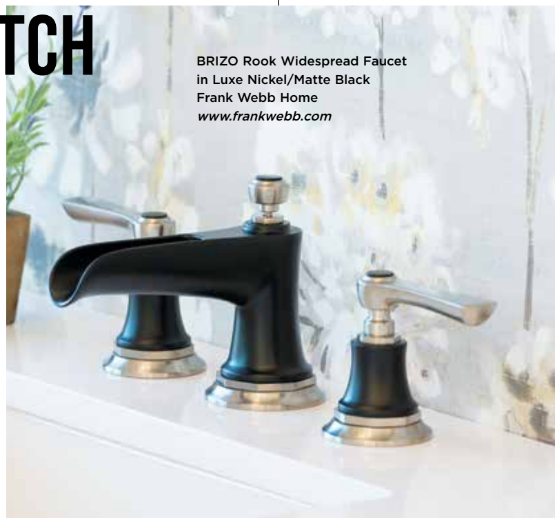
BRIZO Rook Widespread Faucet in Luxe Nickel/Matte Black Frank Webb Home www.frankwebb.com