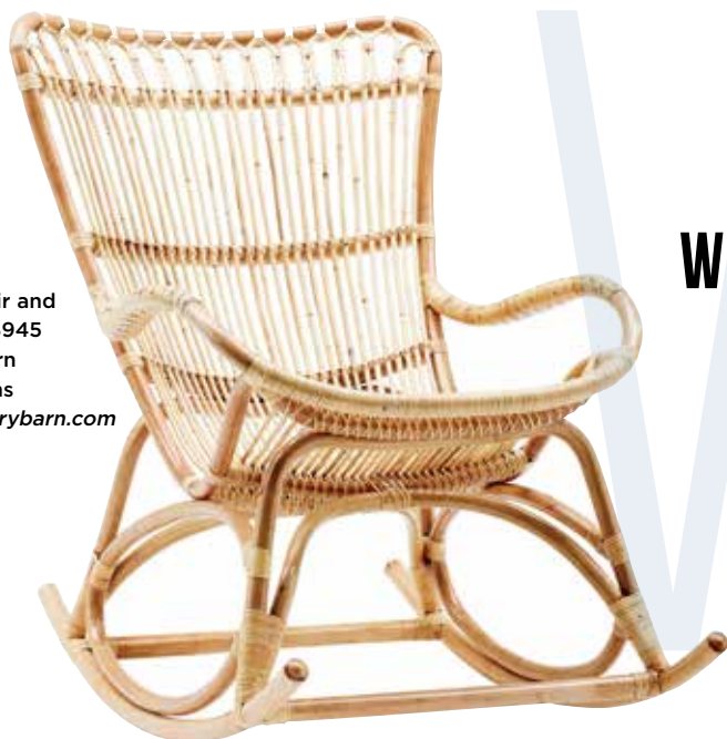
Monet Chair and Ottoman, $945 Pottery Barn White Plains www.potterybarn.com