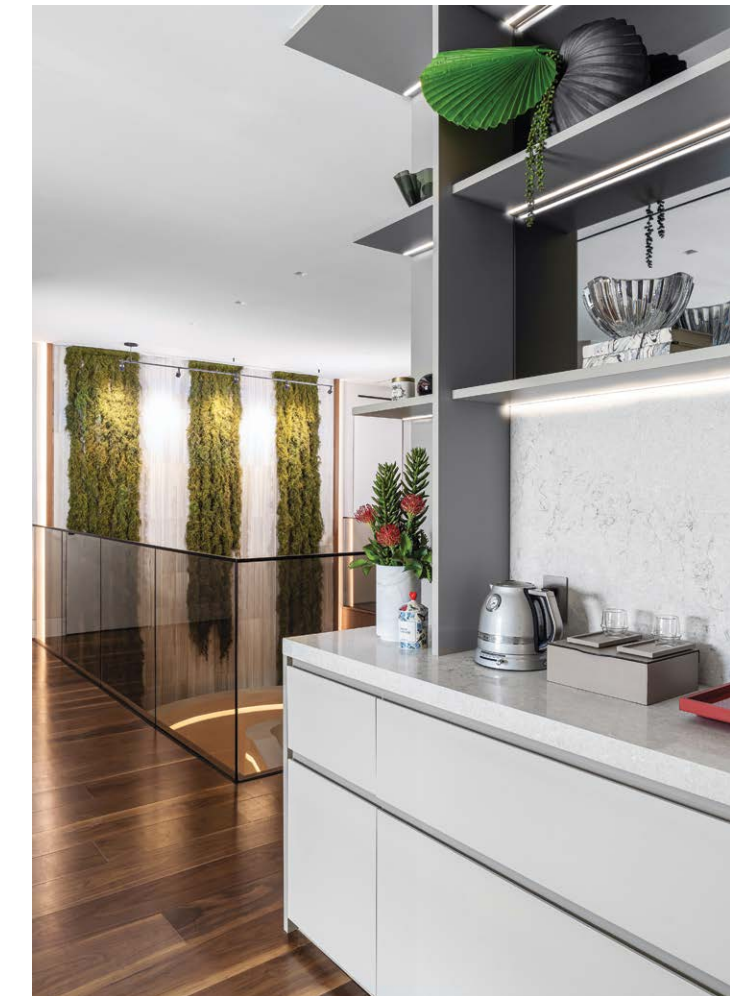
ABOVE: A morning bar was installed to serve all five bedrooms on the upper level, so guests don't need to venture downstairs for coffee or refreshments.