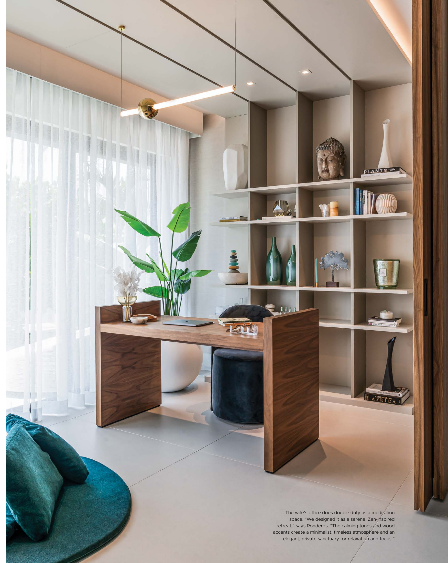
The wife's office does double duty as a meditation space. "We designed it as a serene, Zen-inspired retreat," says Ronderos. "The calming tones and wood accents create a minimalist, timeless atmosphere and an elegant, private sanctuary for relaxation and focus."