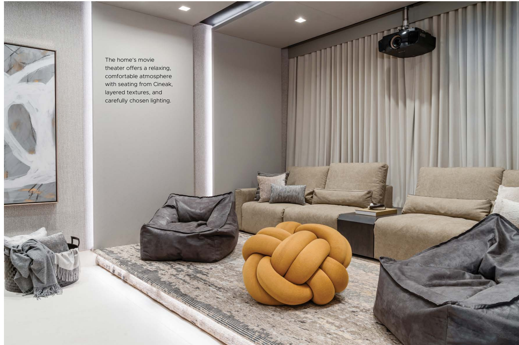
The home's movie theater offers a relaxing, comfortable atmosphere with seating from Cineak, layered textures, and carefully chosen lighting.