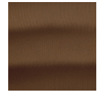
Oil Rubbed Bronze (RB)