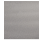
Satin Nickel (SN)