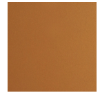
Novel Brass (NB)