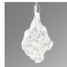
Blossom Clear (BC)