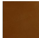
Burnished Bronze (BB)