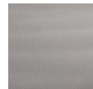
Satin Nickel (SN)