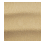
Heritage Brass (HB)