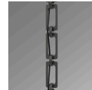
Rectangular Chain (CH3)