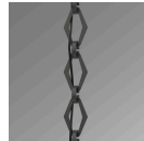
Diamond Chain (CH1)