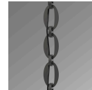
Oval Chain (CH2)