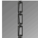
Rectangular Chain (CH3)