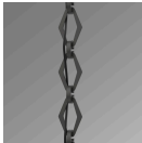
Diamond Chain (CH1)