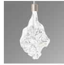
Blossom Clear (BC)