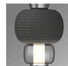
Charcoal Ceramic (CB2)