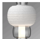
Chalk Ceramic (CB1)