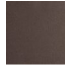
Flat Bronze (FB)