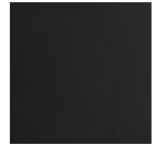
Matte Black (MB)