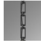
Rectangular Chain (CH3)