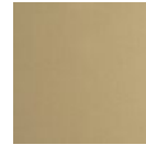
Gilded Brass (GB)