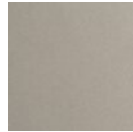
Beige Silver (BS)