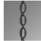
Oval Chain (CH2)