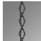
Diamond Chain (CH1)