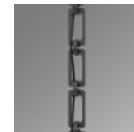
Rectangular Chain (CH3)