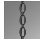
Oval Chain (CH2)