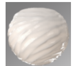
Opal White (WL)