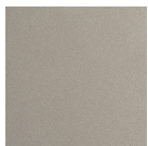
Beige Silver (BS)