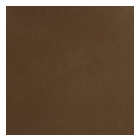
Burnished Bronze (BB)