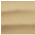
Heritage Brass (HB)