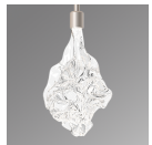
Blossom Clear (BC)