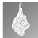
Blossom Clear (BC)