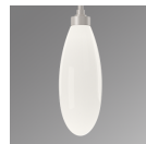
Opal White (WL)