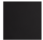
Matte Black (MB)