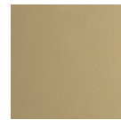
Gilded Brass (GB)