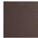
Flat Bronze (FB)