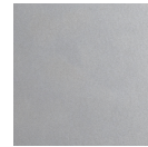
Classic Silver (CS)