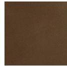
Burnished Bronze (BB)