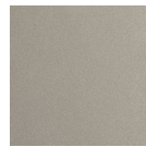
Beige Silver (BS)