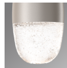
Pebble Clear (PC)