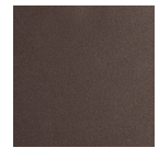
Flat Bronze (FB)