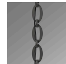
Oval Chain (CH2)