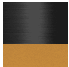
Matte Black & Gold