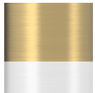
Antique Brass & White